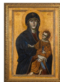
The image of Our Lady, Salus Populi Romani , 'Protectress of the Roman People', is normally kept in the Papal Basilica of St Mary Major, and is very dear to our Holy Father Pope Francis.

We fly to your protection, O Holy Mother of God; do not despise our petitions in our necessities, but deliver us always from every danger, O glorious and blessed Virgin. Amen! Alleluia!