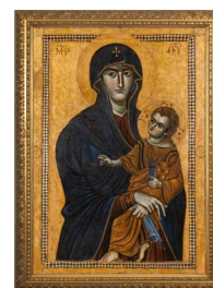
The image of Our Lady. Salus Populi Romani , 'Protectress of the Roman People', is normally kept in the Papal Basilica of St Mary Major, and is very dear to our Holy Father Pope Francis.

O Mary, you shine continuously on our journey as a sign of salvation and hope. We entrust ourselves to you, Health of the Sick, who, at the foot of the Cross, were united with Jesus' suffering, and persevered in your faith. Salus Populi Romani , you know our needs, and we know that you will provide, so that, as at Cana in Galilee, joy and celebration may return after this time of trial. Help us, Mother of Divine Love, to conform ourselves to the will of the Father and to do what Jesus tells us. For he took upon himself our suffering, and burdened himself with our sorrows to bring us, through the Cross, to the joy of the Resurrection. We fly to your protection, O Holy Mother of God; do not despise our petitions in our necessities, but deliver us always from every danger, O glorious and blessed Virgin. Amen! Alleluia!