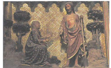
Christ and Mary Magdalene – relief from Notre-Dame cathedral in Paris

Easter is our opportunity to renew our faith and our commitment to Jesus and the teachings of the Gospel.